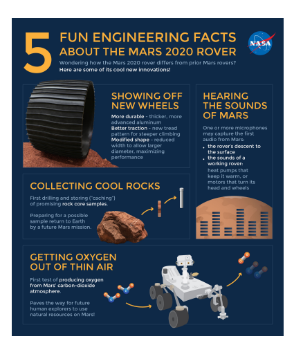
FIG. 1: Upgrades for the Perseverance Rover<sup>1</sup>

Though these make up the basis for the design, Persever-ance improves and changes parts of the past rovers and differs from its' predecessors in many ways. Five main improvements, illustrated through the infographics in Figures 1 and 2, make up the bulk of innovation for this rover - these include improvements on the entry, descent, and landing system (EDLS), caching of samples for further analysis back on Earth, and new wheels to better navigate the terrain of Mars.