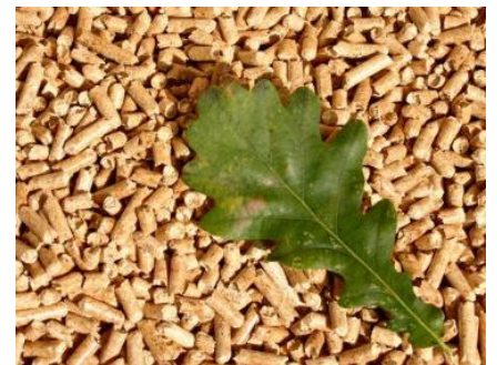
Photograph of wood pellets

Background Information: Bioenergy is energy derived from living matter on the surface of the earth. One biofuel increasingly used in Europe is wood pellets. Wood pellets (seen right) are derived from leftover wood from other commercial uses, tree cut to thin a forest, or trees that do not have other commercial value. Pellets are burned and the resulting energy is converted into electricity.